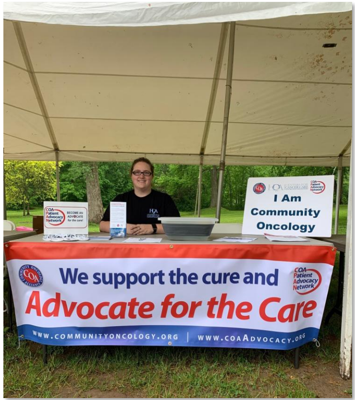
National Survivors Day Community Event

Through CPAN, I can engage with patients beyond my clinical role