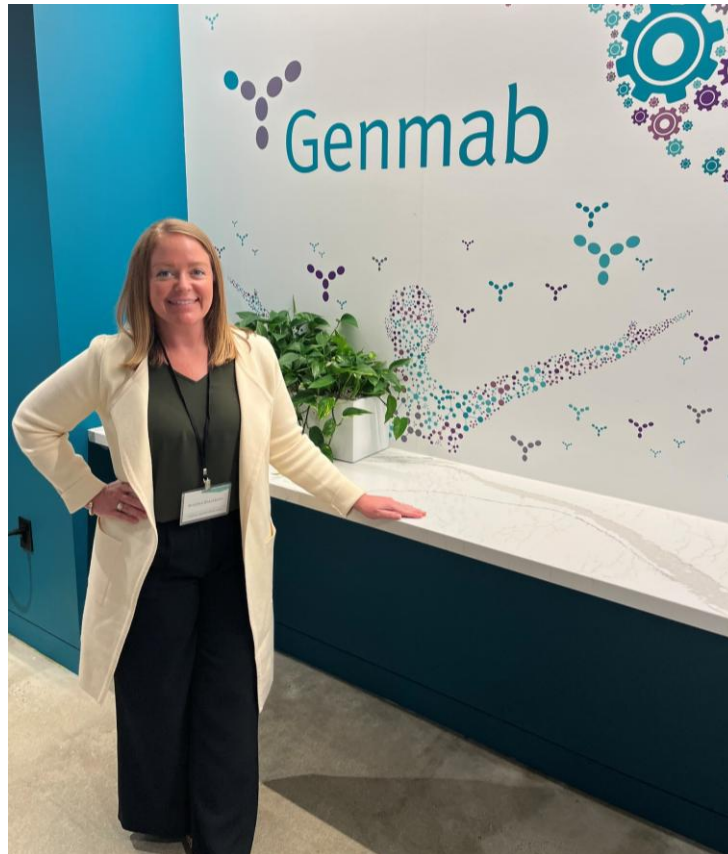
Representing CPAN – COA Industry Partner Genmab’s 4th Annual Science Day - September 2025