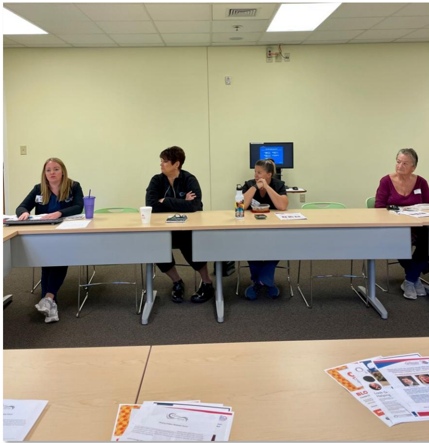
The Value of Community Oncology