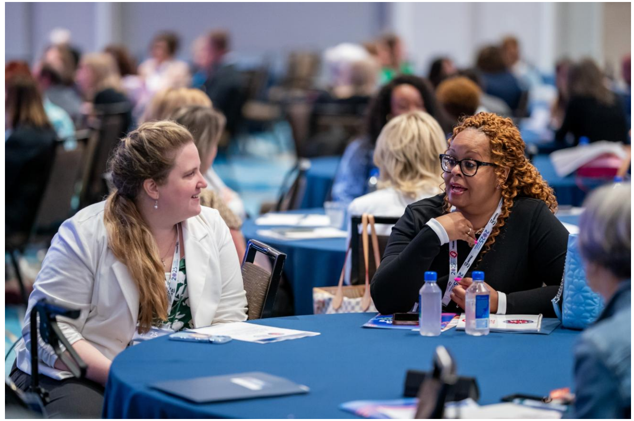
COA Conference Patient Advocacy Track